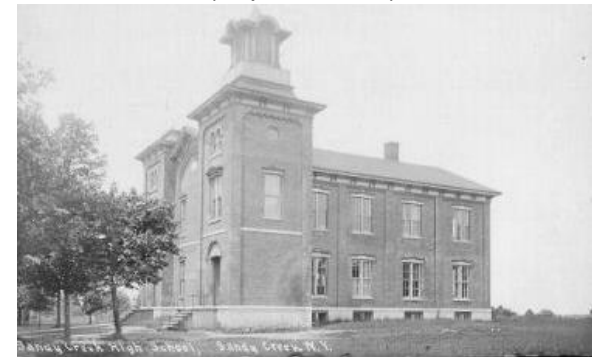
Sandy Creek High School, c1910