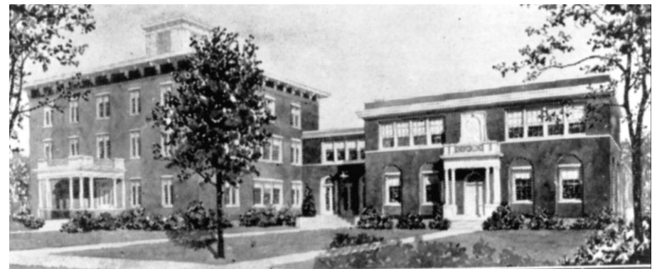
Pulaski Academy & Union School, 1936

All the pleasure that we cherish, soon will pass for'er way And the mem'ries of our school days, sink beneath the shadows gray. Yet there's one thing we'll remember, all the years we yet pass through, 'Tis the thought of old Pulaski and the Crimson and the Blue.