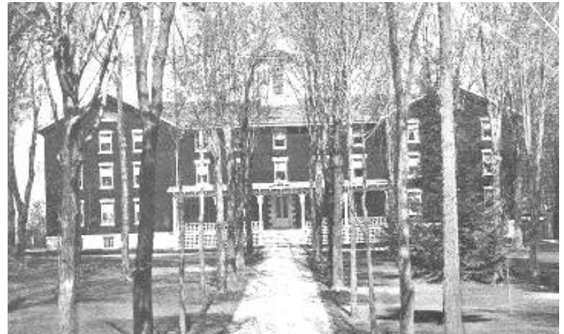
Above: Lowville Academy, c1910

Alma Maters past and present from across Tug Hill