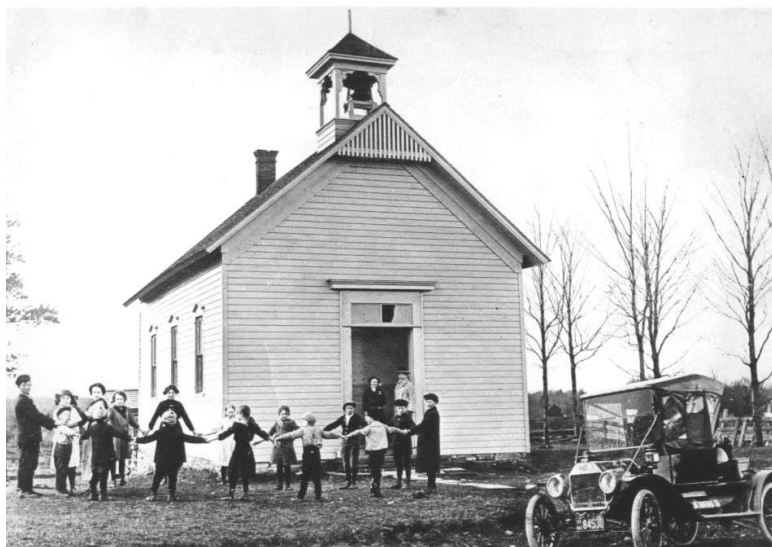
Balcom District, South Redfield

All the pleasures that we cherish soon will pass forever away, And the mem'ries of our school days, sink beneath the shadows gray; Yet there's one thing we'll remember, all the years we yet pass through, 'Tis the thought of dear old Redfield and the orange and the blue