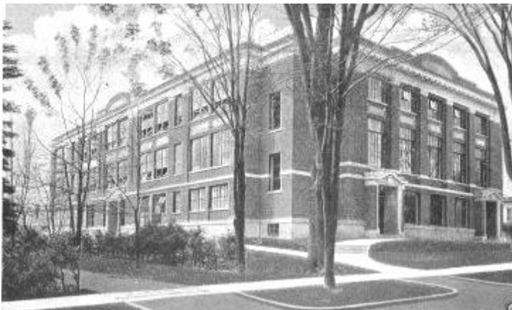
Boonville High School, 1920s

Adirondack our Alma Mater we'll cheer for thee, We'll climb the ladder on to victory. Let the doors be open for the green and white For our Alma Mater we'll always fight.