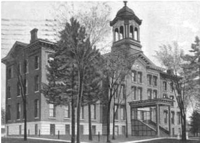
Adams High School, 1911

May Adams High School, our own Alma Mater, Ever continue to do her good work, To encourage good sportsmen as well as good scholars And never one part of her fine creed to shirk.