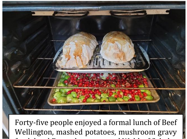
Forty-five people enjoyed a formal lunch of Beef Wellington, mashed potatoes, mushroom gravy fresh local Brussel sprouts, and Waldorf Salad.