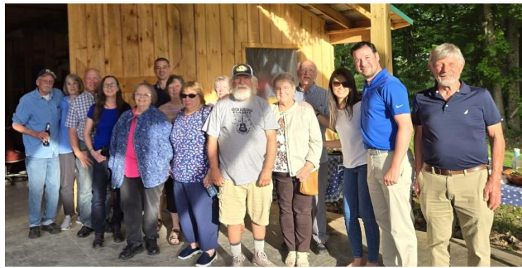
Above Right- On June 1, the Heritage Foundation of Oswego County conducted a bus tour of the Town of Richland/Village of Pulaski with its last stop, half-Shire for a light meal and music in the Grant pavilion and Barn.